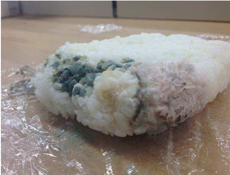
Food Wrap A