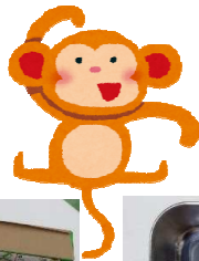
Experiment: Banana under direct sunlight