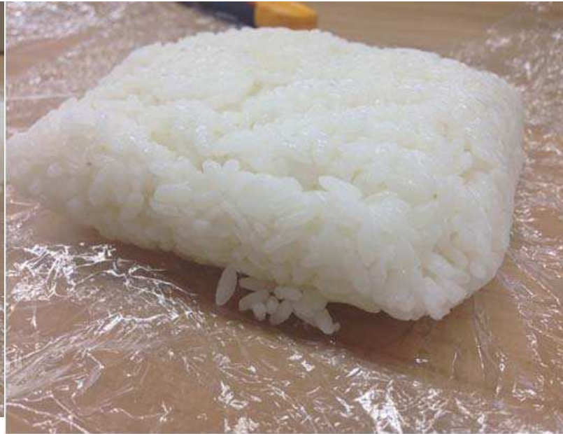
EMBalance Food Wrap